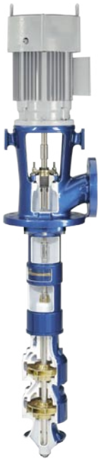
Vertical Turbine Pumps