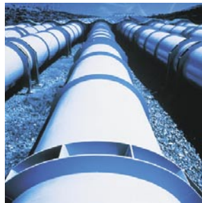
Municipal & Building Trades