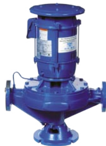
In-Line Centrifugal Pumps