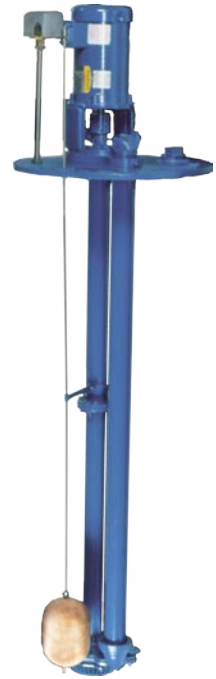
Sump & Sewage Pumps