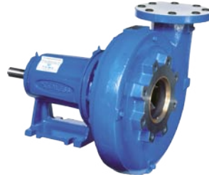
End Suction Pumps