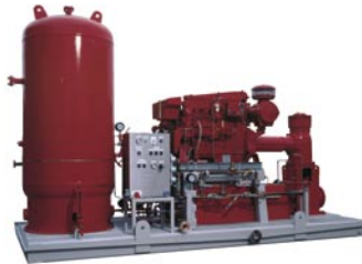
Fire Pumps, Packages and Engineered Systems