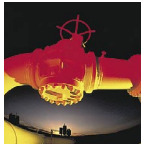
Industrial, Process, Pulp & Paper